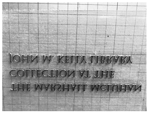
A photopolymer plate on a bedplate at the Kelly Library Print Studio.

Hand-printing increased in cost, letter-press printing became exclusive, and by the 1990s the marriage of lead and paper seemed reserved for wedding invitations. Letterpress still popped its head up in select places—a poetry chapbook, a greeting card, an invitation, or broadside—but anyone wanting to reach many readers quickly would likely choose laser printing. Newspapers, magazines, and major publishing houses depended on the speed and efficiency that digital options provided and letterpress, once the future of publishing, now looked to be a chapter in its history.