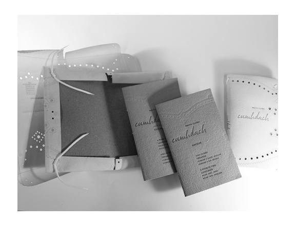
The completed Cumhdach (Kelly Library Print Studio, 2019) with medieval-style limp binding. The leather tackets fix the vellum to the board cover and hold the inner signatures in place.

"All the money, energy, communications, style, ethos—the design geist of that time—was focussed on digital and its possibilities," says Deborah, referring to the 1970s and '80s. "Digital type offers the opportunity for layout to be really fast. So we weren't dealing with editing tools or wood-cutting tools or human error in the same way. When you made an error in a digital file, you corrected it instantly. The speed to press and the product's speed to market was increased enormously with the efficiencies inherent in digital process."